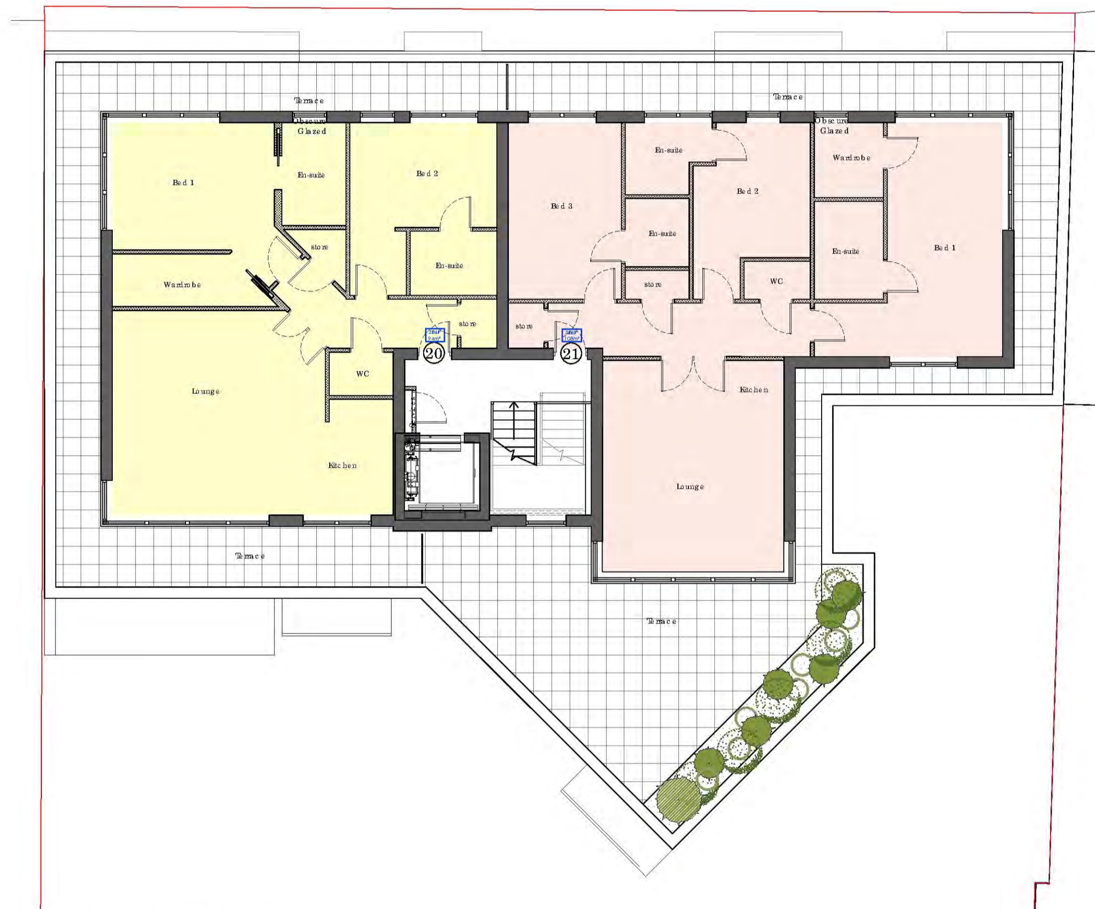
1 Proposed Fourth Floor plan

Do not scale this drawing. Work to figured dimensions only. This drawing is copyright of APS Design and should only be reproduced with their express permission. Check all dimensions on site. Any discrepancies should be reported to APS Design prior to commencement.